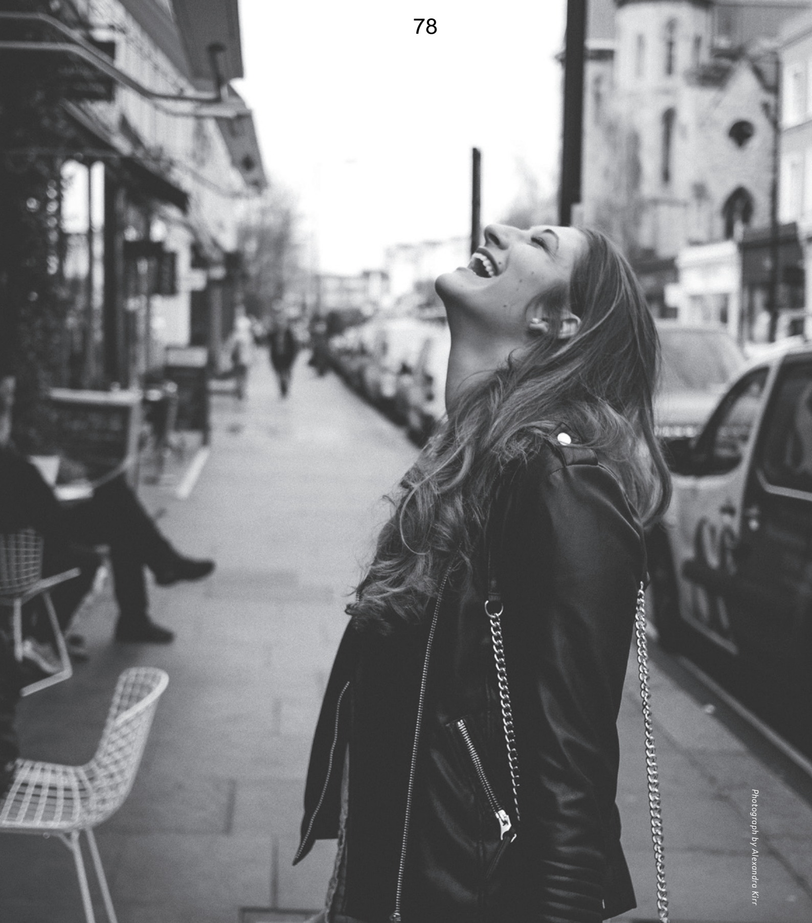
Photograph by Alexandra Kirr